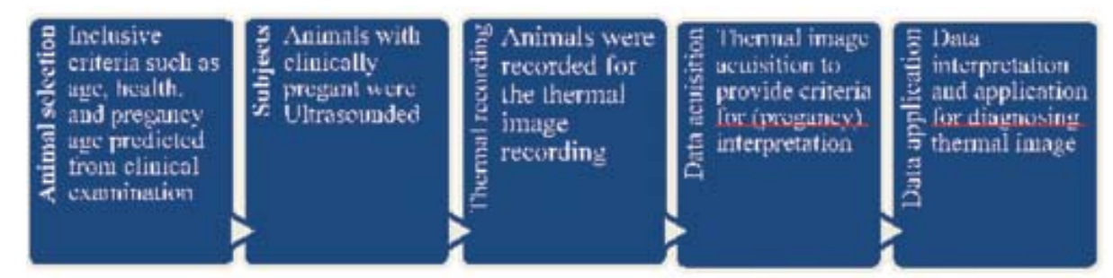
Figure 1. Flow charts of thermal imaging recording and image processing

Figure 4 shows some sample images used in the training and testing processes. As an input, the dimension of all images was resized